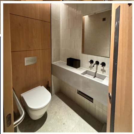
Alto Cito emergency release system, finished in high pressure laminate.