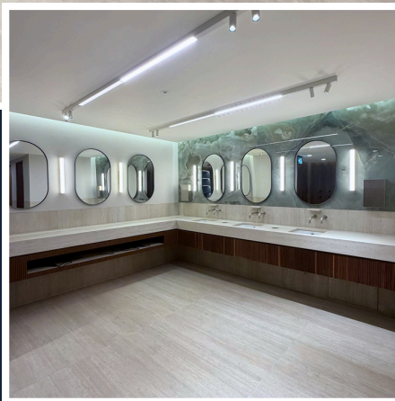
Dekton vanity tops and superloo troughs with Roma Walnut Fascia's. Bespoke mirrors with trims