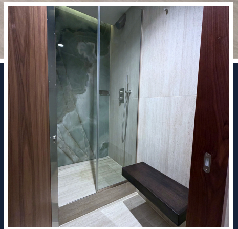
Door sets with shower bench.