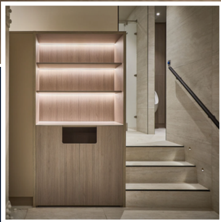
HPL towel stations with integrated LED lighting.