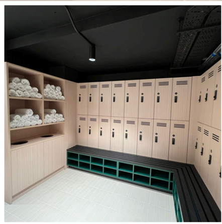
Octave Veneered lockers with Ojmar OCS Pro Locks and Integral bench and shoe store.