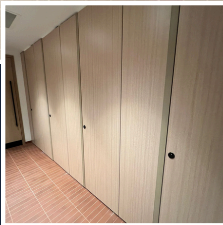
Alto Cito Cubicles in Oak Laminate.